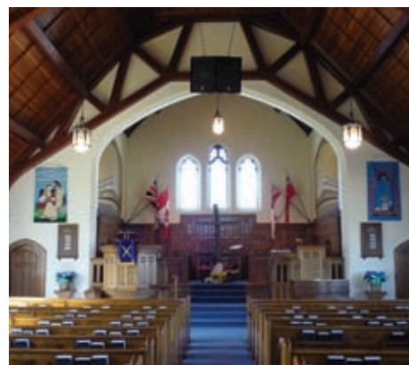
Pipes in the sanctuary of Renfrew Presbyterian Console is at the right