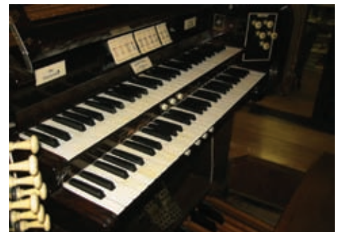
Original console and Casavant name plate.