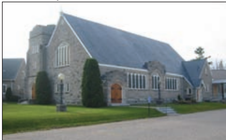
Renfrew Presbyterian Church, Renfrew, Ontario

O The month of May holds many anniversaries for the author of this part of the newsletter. In total, five will take place this month. But this year, one is extra-special. My love and passion for the pipe organ started exactly 60 years ago in my home town of Renfrew, Ontario — yes I am a proud valley lad! Where it all started was Renfrew Presbyterian Church, built in 1925, this year celebrating its 85 th anniversary.